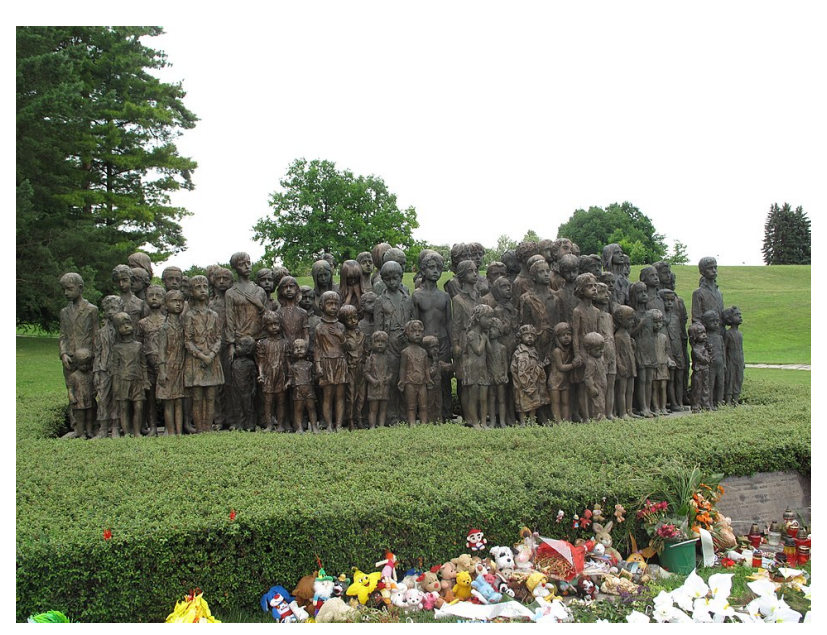
Memorial to the children of Lidice overlooking the site of the massacre.