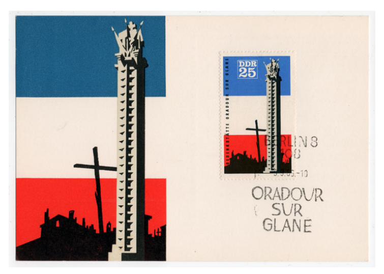
Postal stamp from the GDR commemorating Oradour-sur-Glane, showing the monument to the 642 victims of the massacre.