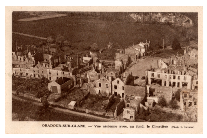
Postcard from August 1949 (Zeina Elcheikh). Among the stamps, one reads "Oradour S/GL, 10 Juin 1944, souviens-toi, Remember". A commemorative sign with the inscription "souviens-toi, remember" is located at the entrance of Oradour.