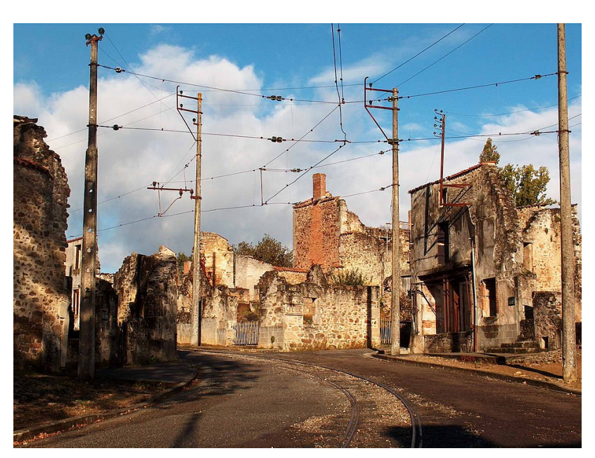
Preserving the ruins of Oradour led to the freezing of time in the remains of the village. With the time passing, weathering washed away the blackened stones and vegetation spread through the ruins. Oktober 2004.