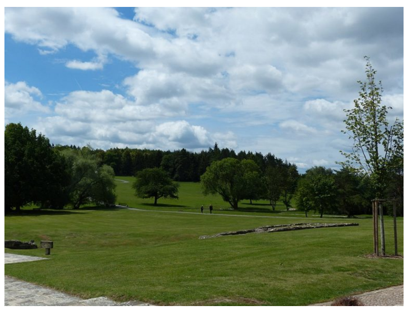
People walking through the landscape where Lidice once stood.

Physical remains can evoke an understanding of the past and its history. Absence and silence can do the same. The ruins in Oradour are an authentic part of the commemorative landscape. On the other hand, the lack of physical remains in Lidice – except for a few visible foundations – led to other alternatives of remembrance in the silent scenery. Between moving on and looking back, 10 June in Lidice and Oradoursur-Glane will keep curating memory in absence and ruins.