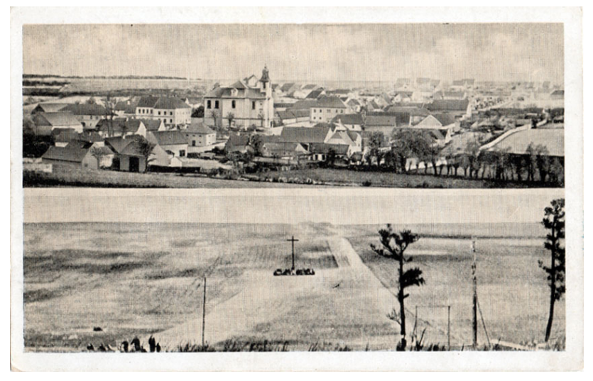
Postcard showing Lidice before and after the massacre (Zeina Elcheikh).

Among the atrocities committed by the Nazis during the Second World War Lidice remained an unusual case. The non-Jew ish Czech village, located 22 kilometers northw est of Prague, w as the target after Czech resistance fighters seriously injured Reinhard Heydrich in an assassination attempt on May 27, 1942. "Operation Anthropoid" w as the code name for the attack on the high-ranking German SS and police official w ho served as deputy Reichsprotektor in Bohemia and Moravia. In retaliation for the death of Heydrich on June 4, Lidice w as burnt down and razed to the ground on June 10. Only a few ruins remained scattered in the silent landscape: the foundations of a farm, the church of St. Martin and a former local school. The men w ere immediately shot and the w omen sent to concentration camps. The children of the village, w ho w ere considered capable of being "Germanized", w ere sent to German SS families, and the others w ere murdered.