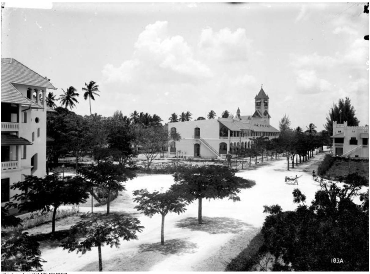
Bundesarchiv, Bild 105-DOA0183 Foto: Dobbertin, Walther | 1906/1918

The Wissmannplatz in Dar es Salaam with the monument, between 1906 and 1918. Bundesarchiv, Bild 105-DOA0183 / Walther Dobbertin. Quelle: <u>Wikimedia Commons</u>. Lizenz: <u>CC BY-SA 3.0</u>.