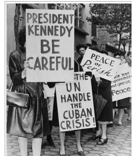
Group of women from "Women Strike for Peace" holding placards relating to the Cuban missile crisis and to peace, 1962.

A second type of usage refers to one of three things: to domestic conflicts within a certain government that threaten its existence, to the period after the fall of a government until a new government assumes power, or to a political conflict that may endanger the entire political system and where strong forces are calling for its replacement. For instance, Italian governments have been notoriously unstable, resulting in frequent cabinet-shuffles, or transformismo , in which political challengers are integrated into the existing system. [34] Similarly,