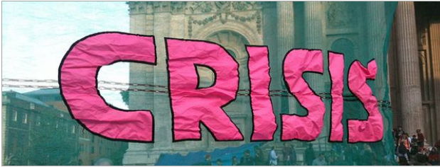
Protest Banner reading "Crisis" during Occupy London protests at St. Pauls Cathedral, Photo: Neil Cummings, London 16th October 2011, Source: flickr, License: CC BY-SA 2.0